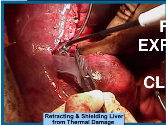
Retracting & Shielding Liver from Thermal Damage (Liver Resection)